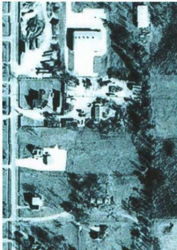
TXDOT 01-09-1996 Aerial Photograph